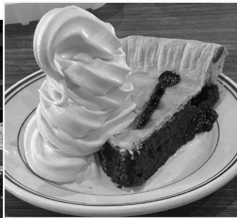
Left to Right: Duffy's restaurant - we took up an L-shaped table!; wild blackberry pie with ice cream; warmth of an evening firepit; chocolate cake served at Dessert night!