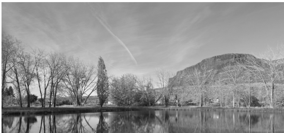
Steamboat Rock State Park

Near the end of October, we returned to fabulous Steamboat Rock State Park. We have camped there at least once, year after year.