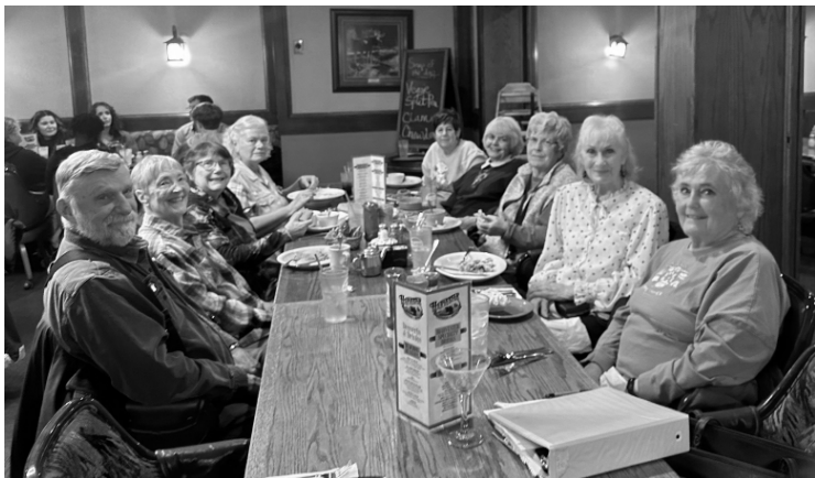
Dinner at Beebe