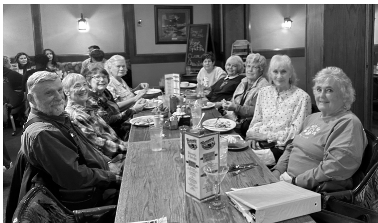
Spangle Harvester Restaurant