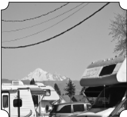
The beauty of Mt. Baker