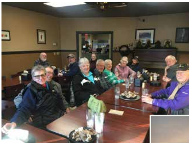
White-tail Sams at the Pizza Factory

View of a sunset from the Crump's house on Deer Lake